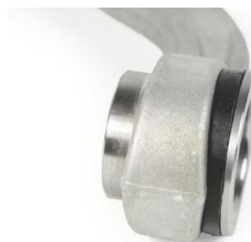
Figure 2 - Fully pressed rear Outer Shell